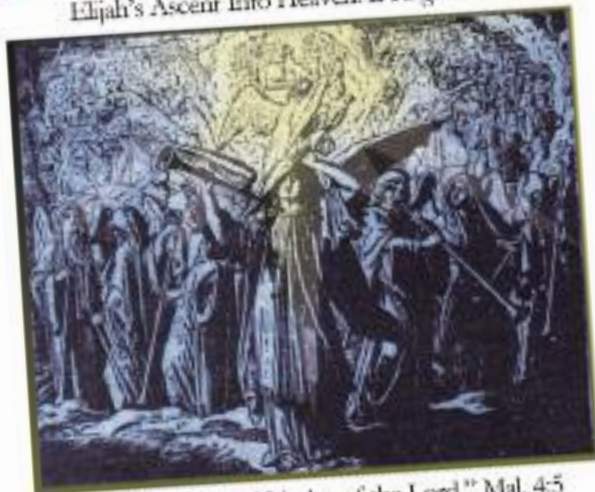
"The great and dreadful day of the Lord." Mal. 4:5

Everything that can be done will be done to distort the Truth and thus distract and dishearten believers and draw their attention to something other than the message of Elijah. — page 7