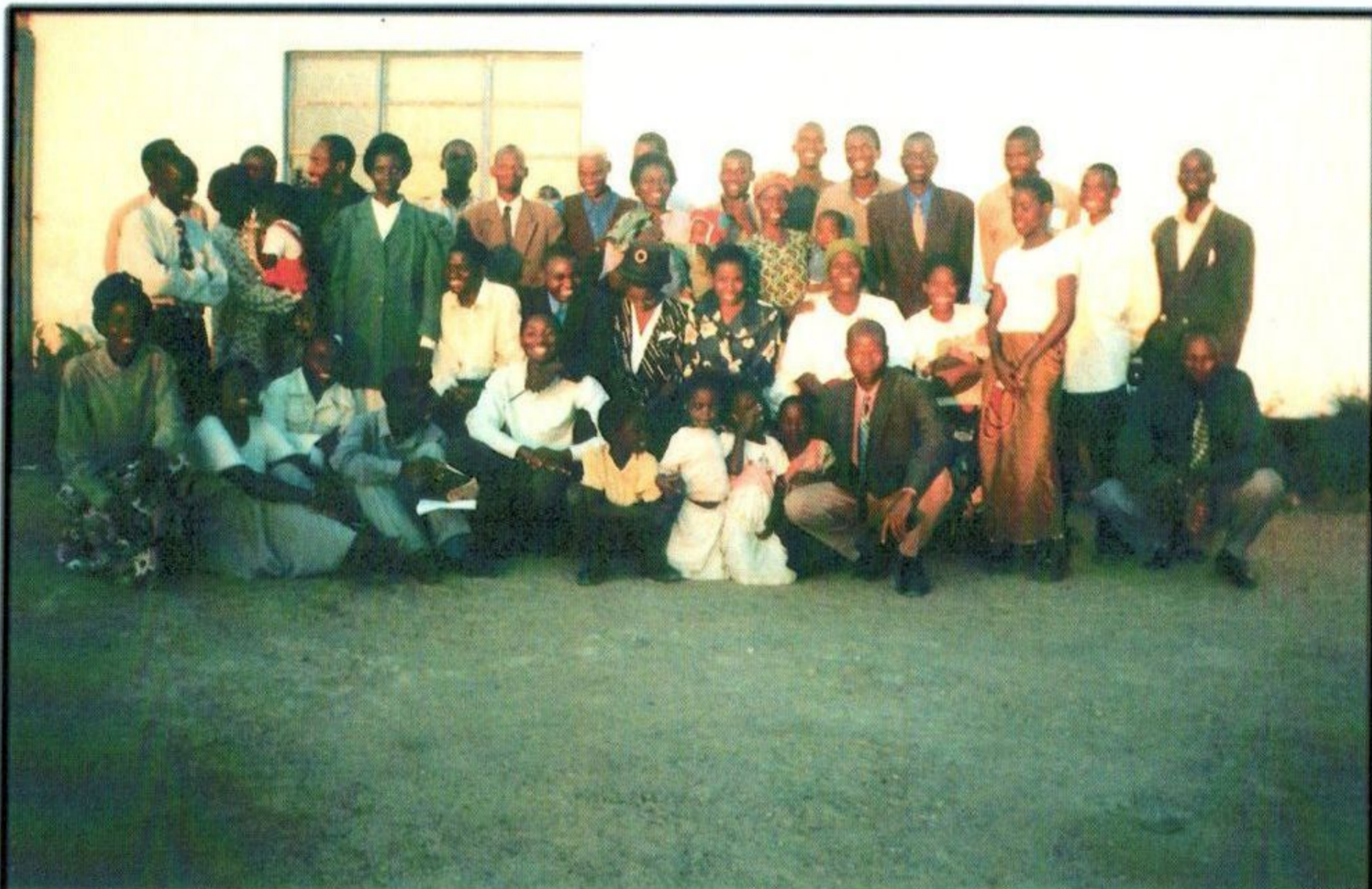
PART OF THE DELEGATION. 2002 SESSION - LUSAKA, ZAMBIA