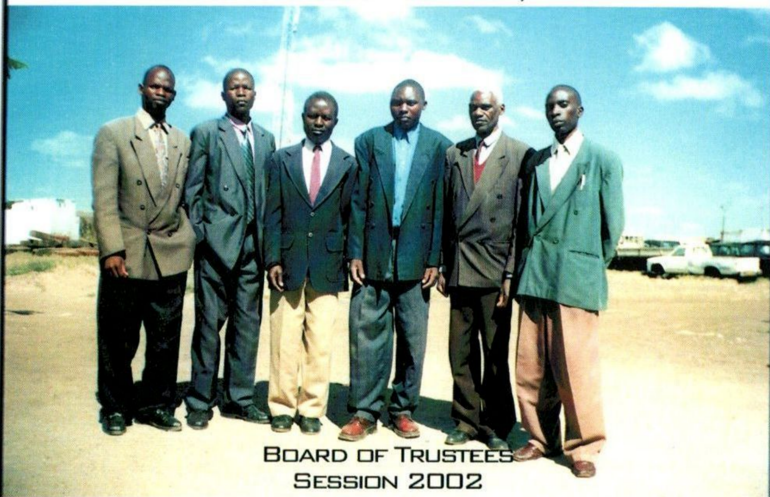
BOARD OF TRUSTEES SESSION 2002 LUSAKA, ZAMBIA