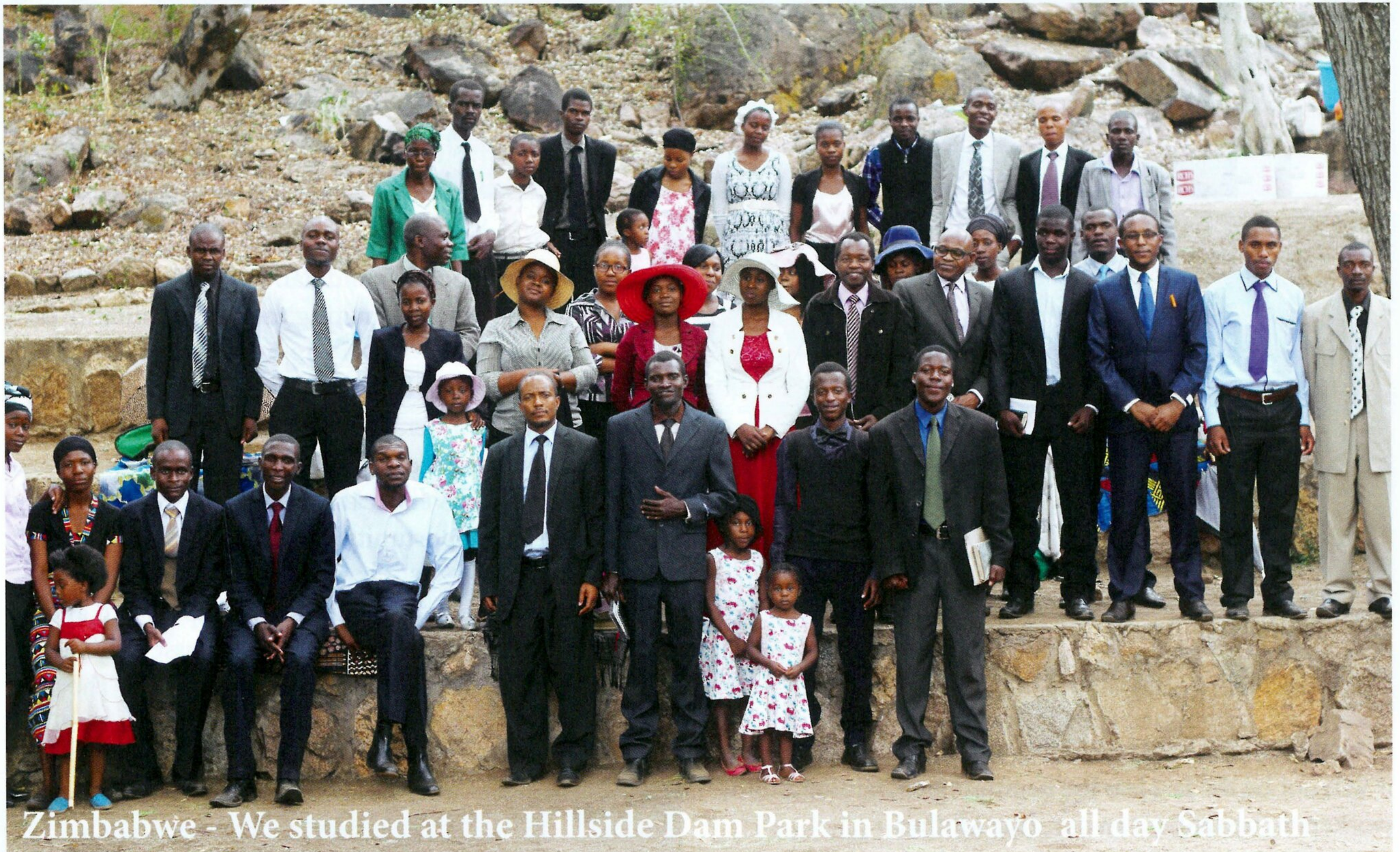
Zimbabwe - We studied at the Hillside Dam Park in Bulawayo all day Sabbath

sweet fellowship, beautiful singing, studying the Word, simple enjoyable lunch and nature walk. It was such a beautiful Sabbath. May we continue to lift up the brethren and the work in Zimbabwe before the throne of grace.