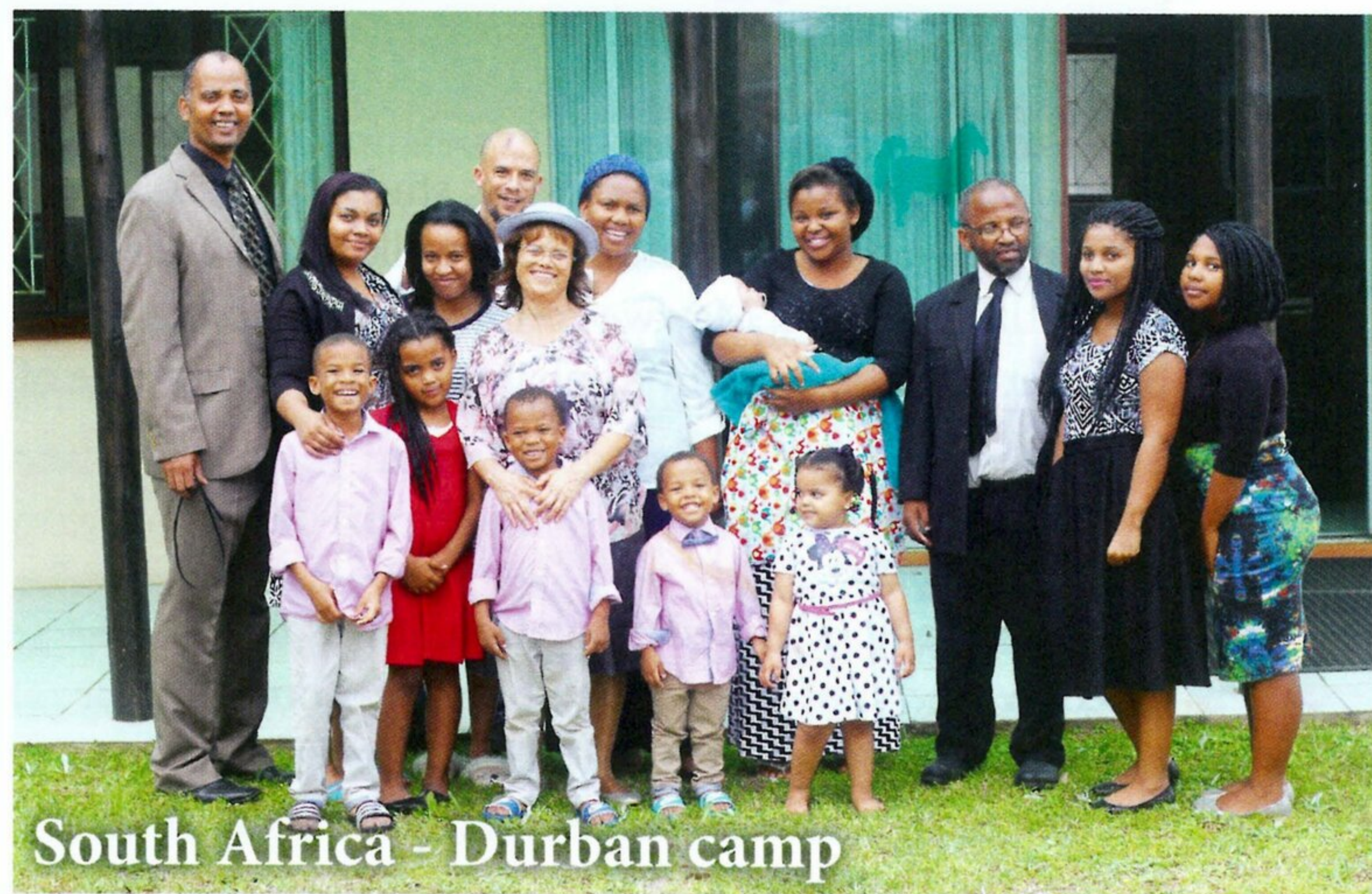
South Africa - Durban camp