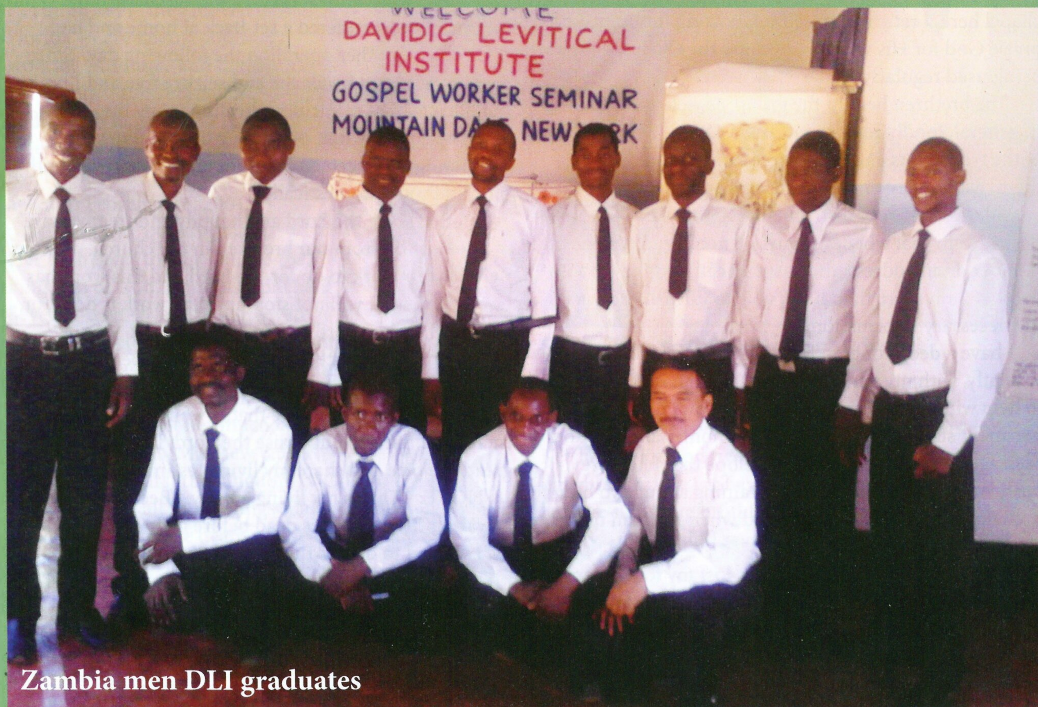
Zambia men DLI graduates