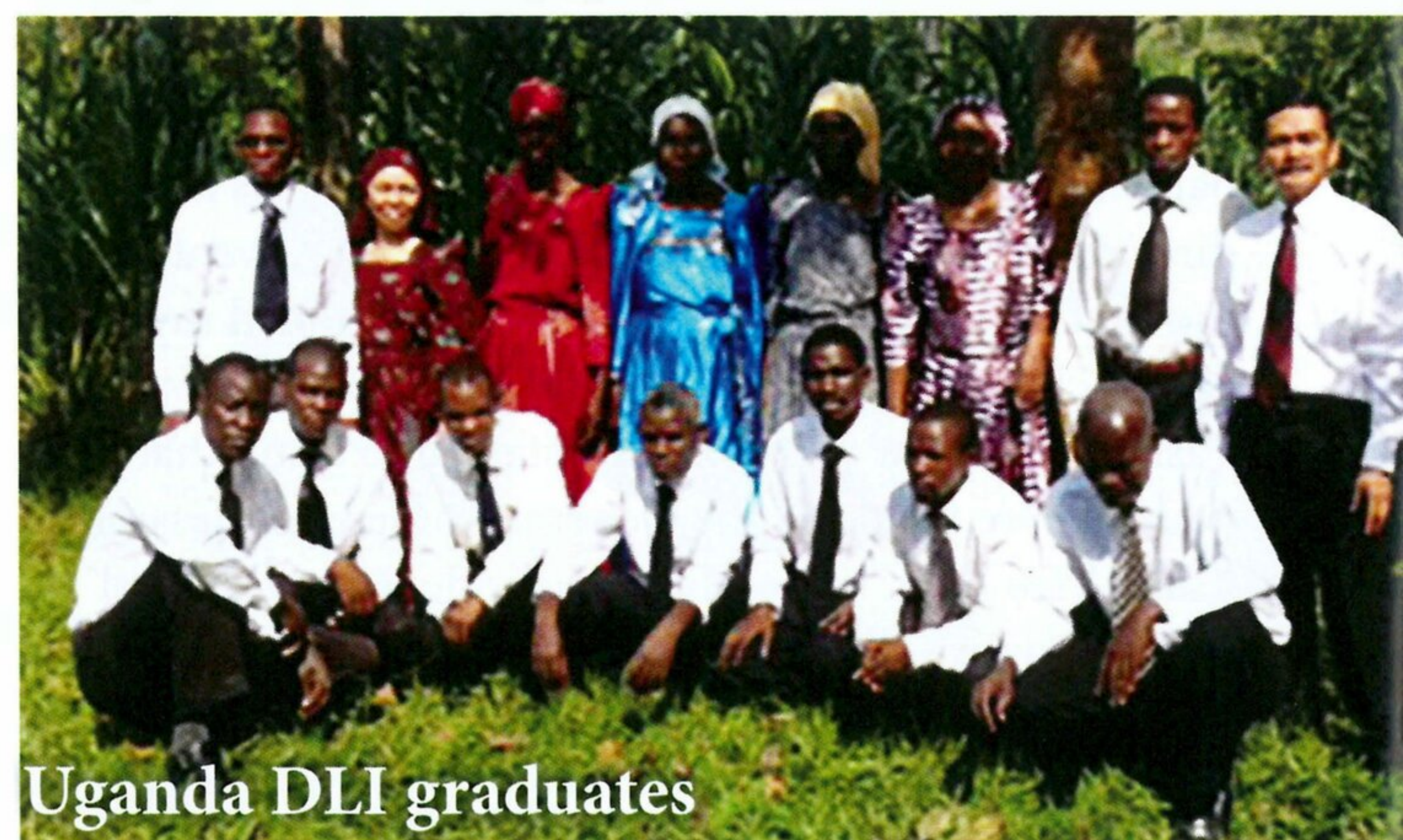
Uganda DLI graduates

The DLI Class was composed of a number of languages in that we have students coming from different countries, like French and the different dialect in Uganda. Everybody as a Team worked together and unitedly for the purpose of learning how to share the message effectively to our fellow brothers and Sisters in the church.