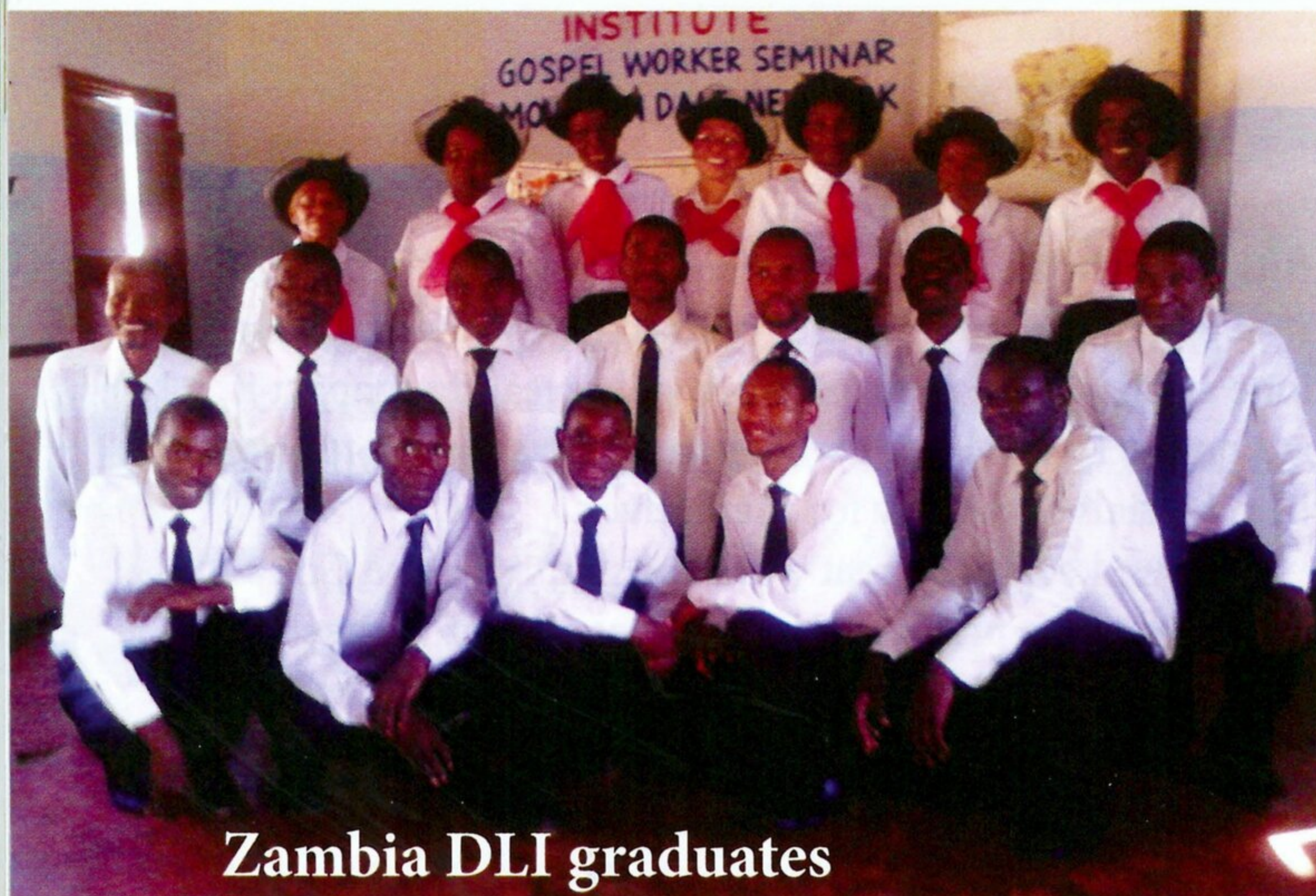
Zambia DLI graduates

Our training went on so well with eighteen (18) students present and graduated. It is our prayer and hope that they will use what they have learned and be effective workers in the field. This DLI was the first ever