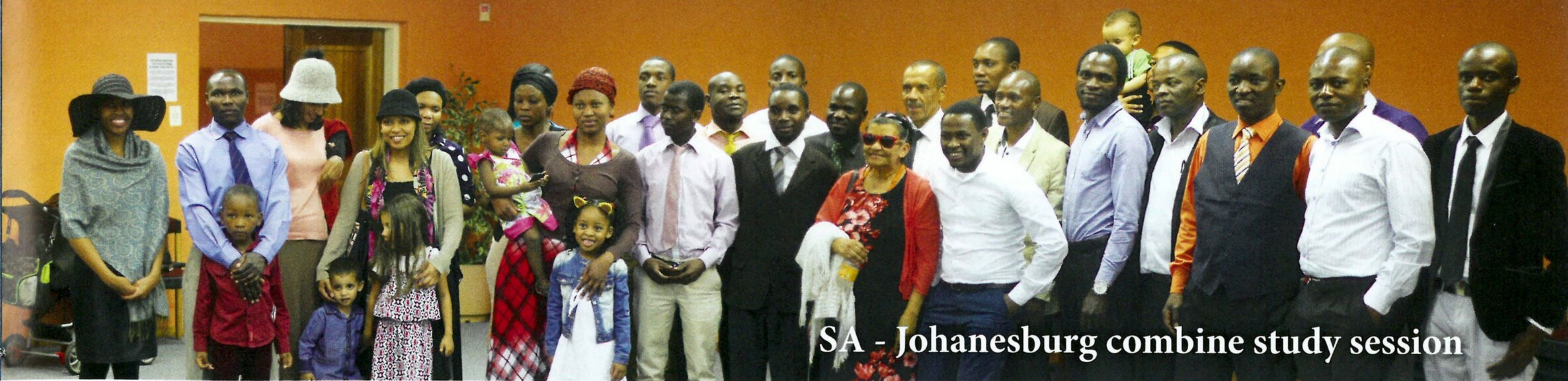
SA - Johannesburg combine study session