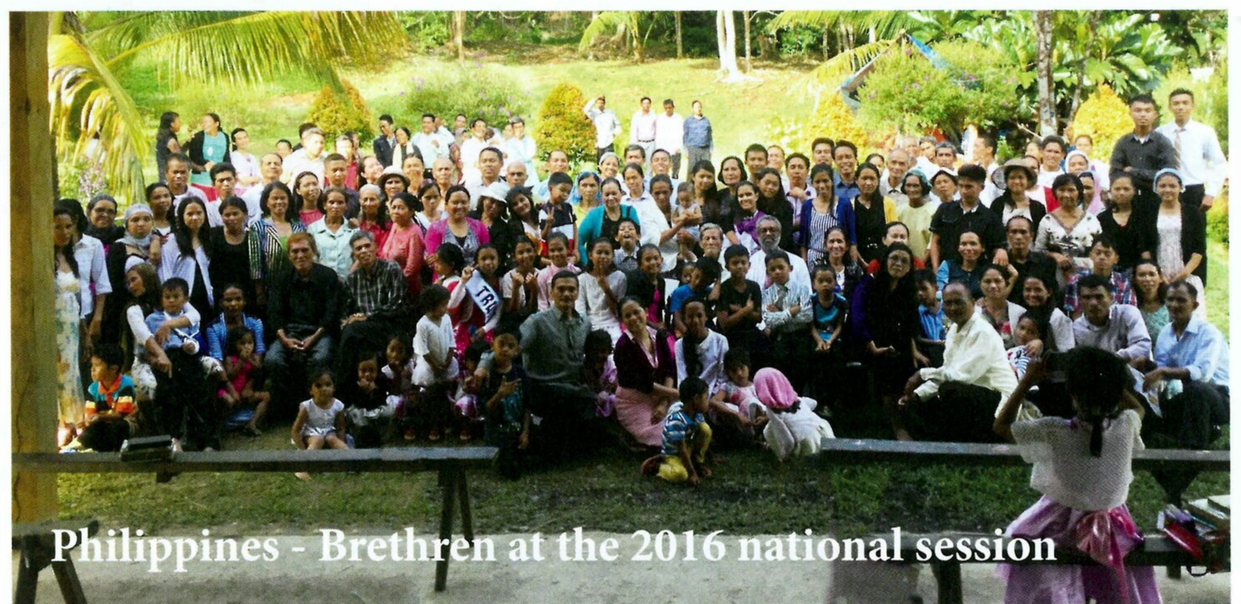
Philippines - Brethren at the 2016 national session

On arrival the Youth were finishing their portion of meetings. There were many youths in attendance and the program was very good. Many adults were already there and more continued to arrive after. There may have been about 200 persons in attendance from different Islands of the Philippines, some having traveled for 3 days to attend. Yet, many were still unable to attend due